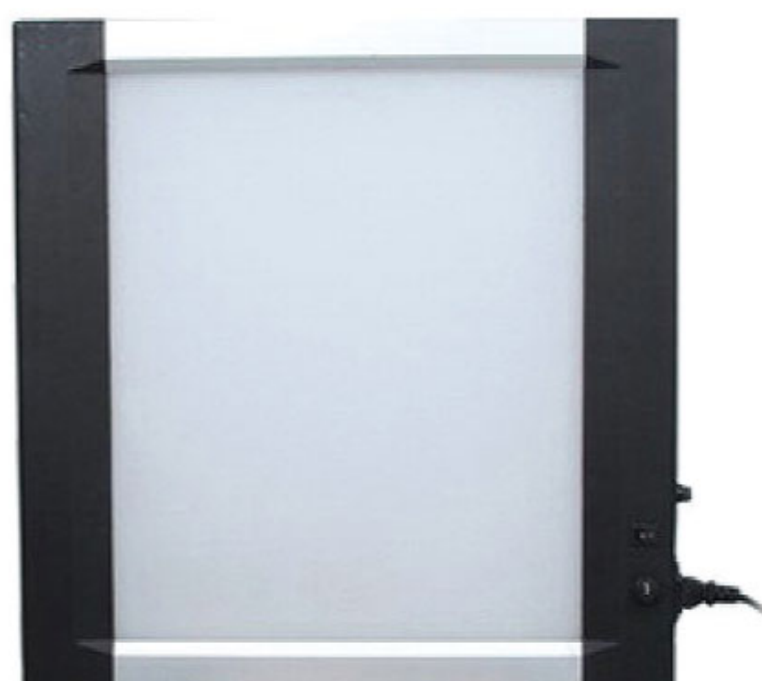
Item Code: 91000