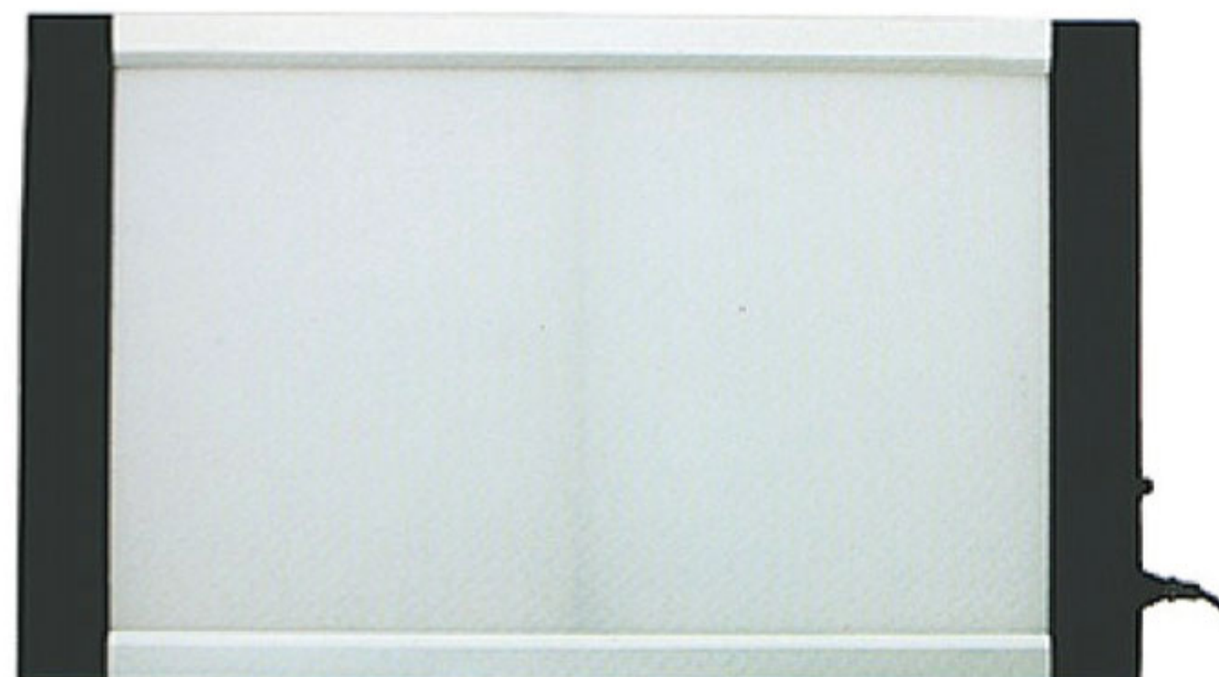
Item Code: 91001