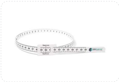
Double Function : Head Circumference with front side of the tape and facial symmetry the rear side of the tape.